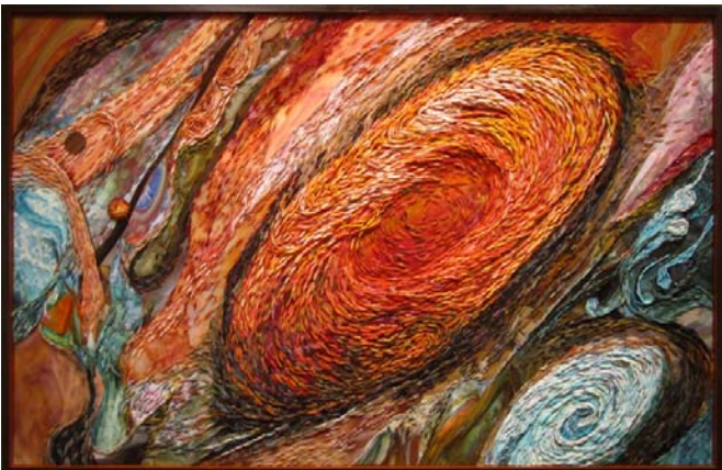
Jupiter: Great Red Spot

Cost: $200, plus materials, or bring your own.